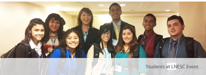
Students at LNEsc Event

Today, young adults have tremendous opportunities to consider all of our societal needs and create innovative solutions to solve the challenges we face. The students of GEN I stand to make ground breaking discoveries at a faster pace than any other generation in history. NISSAN GEN I educational programs aim to close gaps to educational access, to inspire all students to think big and to create a community of support equipping students with skills needed to make their dreams and ideas a reality.